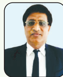
Conference in Chair

Dean & Chairman, Faculty of Commerce Univ. College of Commerce & Mgt. Studies Mohanlal Sukhadia University, Udaipur